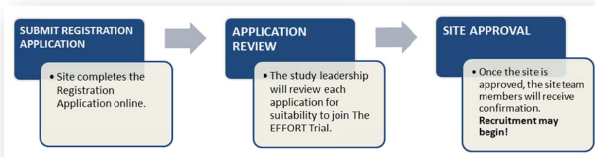
Figure 3: Overview of Site Registration

ICUs from around the world will voluntarily register their interest in participating in the EFFORT Trial. Site registration is the formal process where an interested site submits an application to join. Once the study leadership has reviewed the registration application, formal approval will be granted and the site may begin study recruitment activities. The figure below outlines this process.